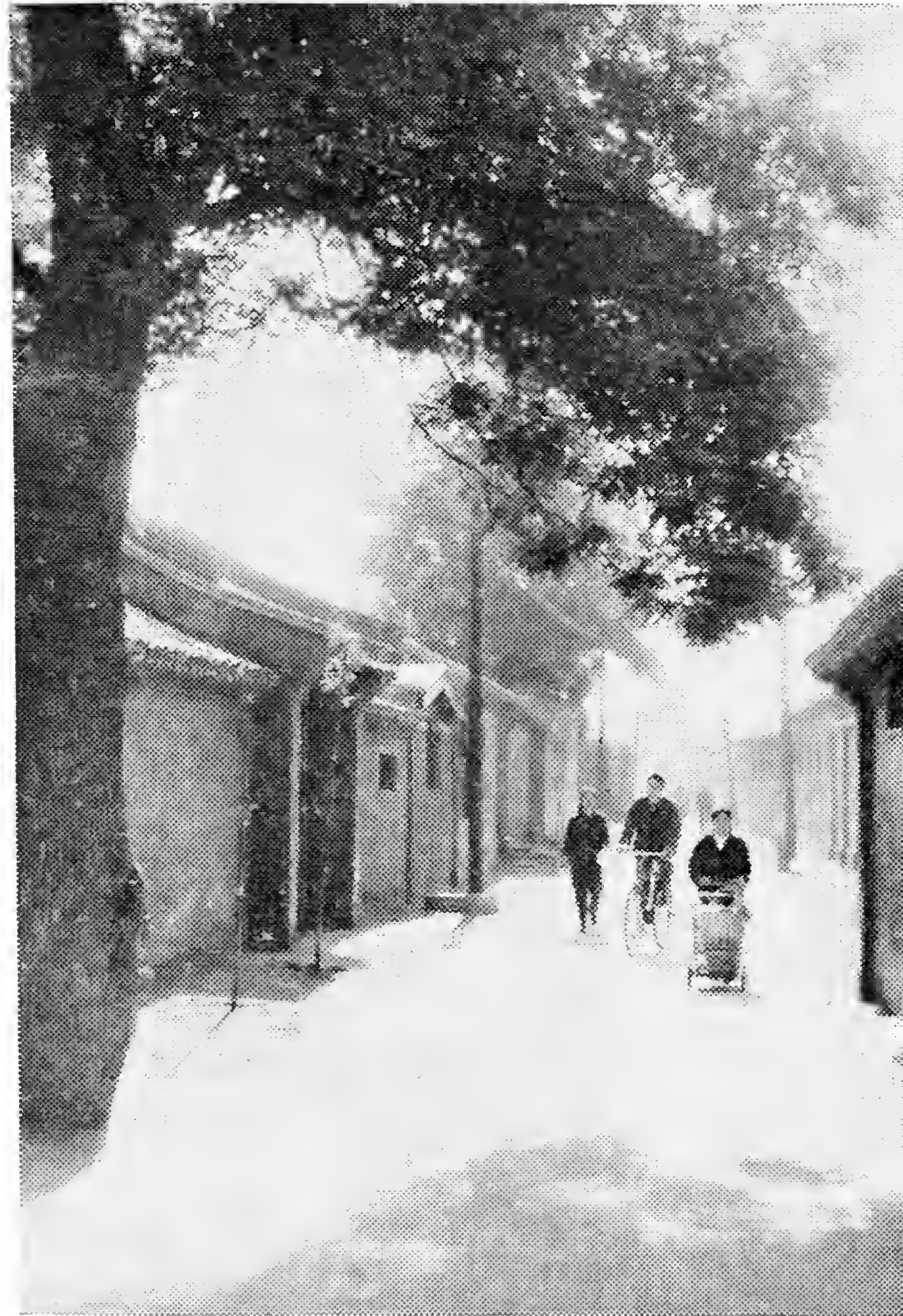
Morning in a small lane.